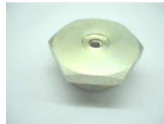
Fuel Injection Components